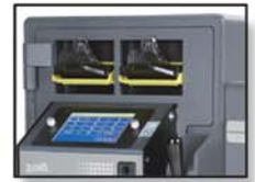
Sentinel Tube Vend with dual note validators