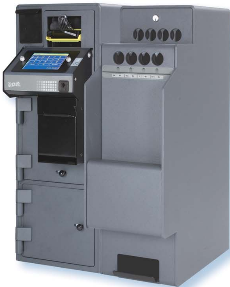
Shown with single note validator (dual available)