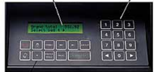
Function & Programming Keys

Bag stops are exact and user programmable. The Pelican sorter can be configured as a counter-top sorter with coin drawers or can be set up on a stand to facilitate the bagging of up to five coin denominations.