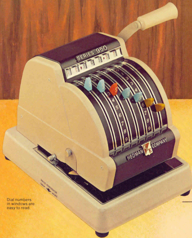
Dial numbers in windows are easy to read.