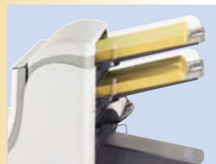
2 sheet feeders and 1 insert/BRE feeder