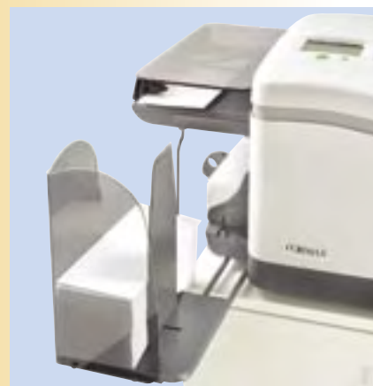
Side Exit Tray