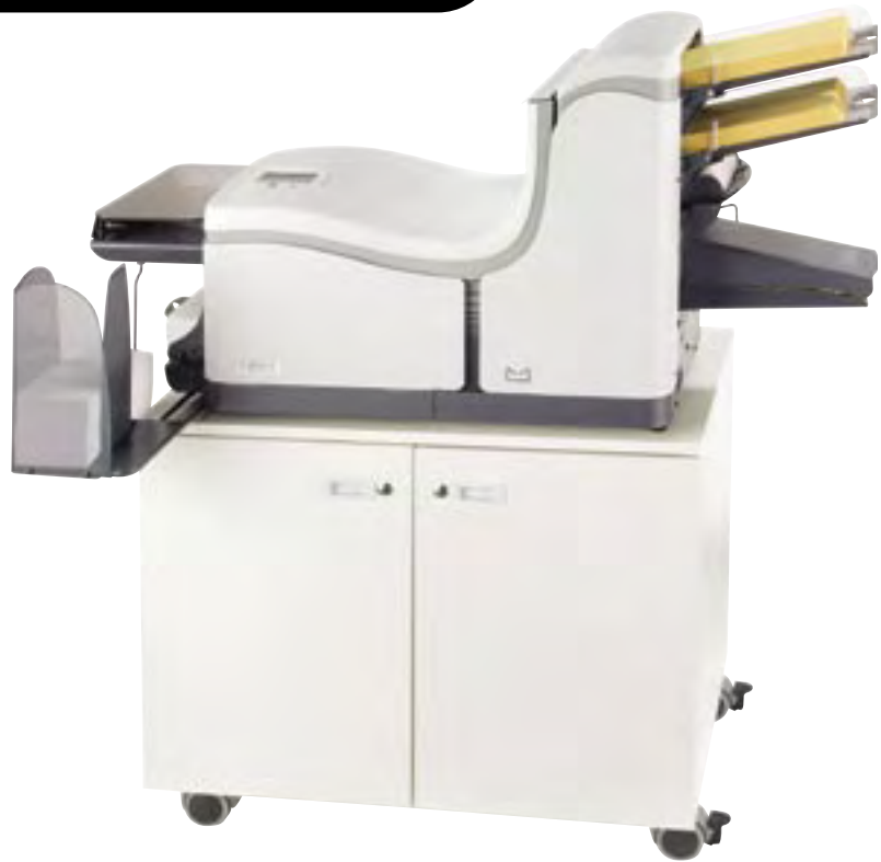
Shown with Optional Side Exit Tray and Cabinet