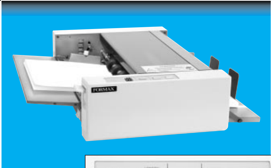
Operator Friendly Control Panel