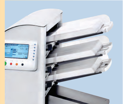
Horizontal feeders with a loading capacity of up to 325 sheets each