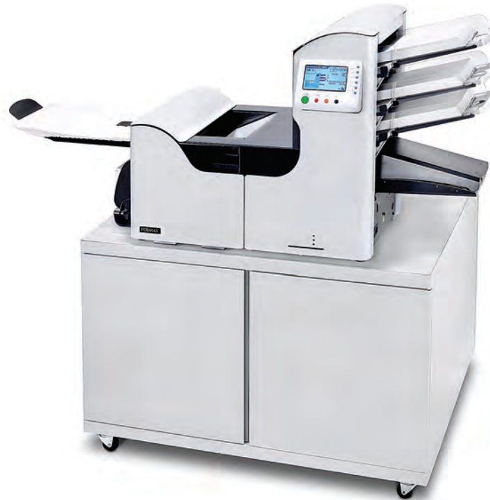
Shown w/ optional Conveyor & Cabinet