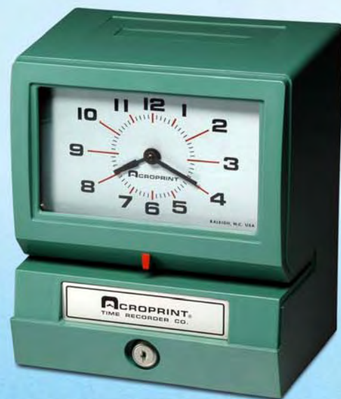
Model 150 AUTOMATIC PRINT