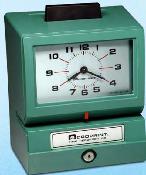
Model 125 MANUAL PRINT